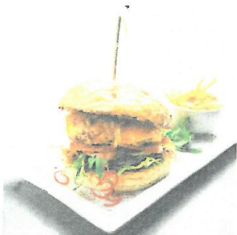
Gourmet Beef Burger