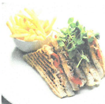
Tuna Mayonnaise Sandwich