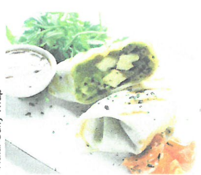
Natal Curry Wrap

Salad Greens, Roma Tomatoes, Calamata Olives, Red Onion Slices, Cucumber and Feta Cheese served with Greek Herbed Dressing.