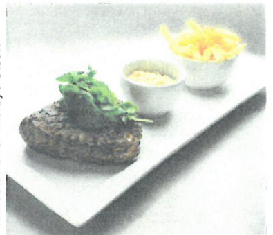
Grilled Fillet or Rib Eye Steak