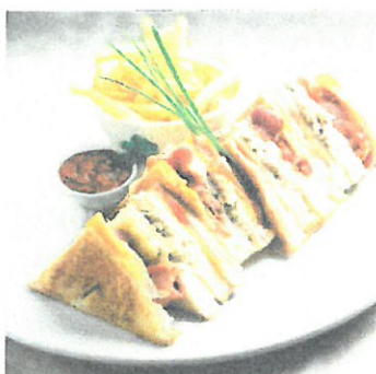
Blue Waters Club Sandwich