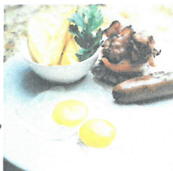
Full English Breakfast