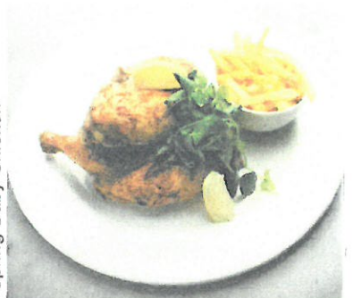
Spring Baby Chicken