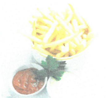
Plated French Fry Platter