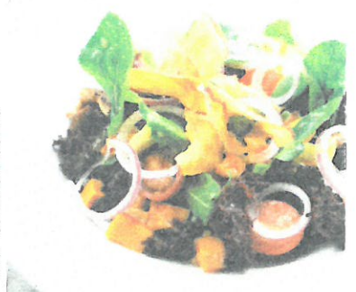
Thai Chicken Salad