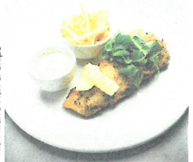
Rich Man's Fish & Chips